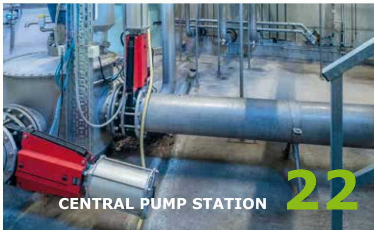
CENTRAL PUMP STATION