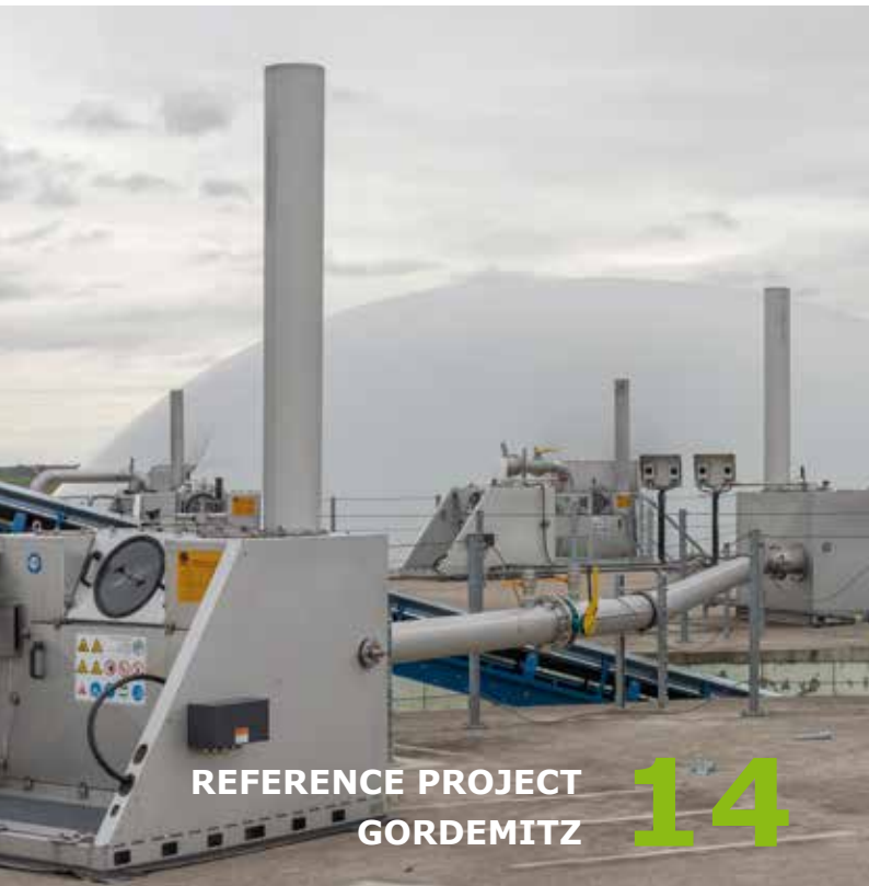
REFERENCE PROJECT GORDEMITZ